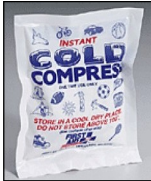
Instant cold ice packs