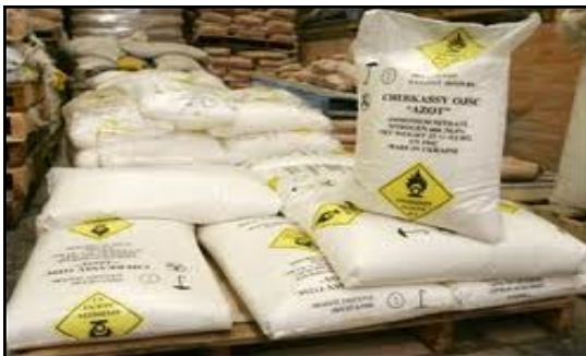
Ammonium nitrate / fertilizers