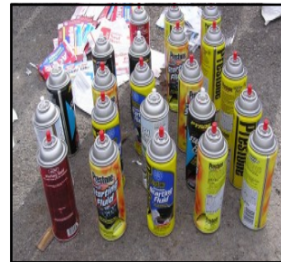
Ethyl ether (engine starter fluid)