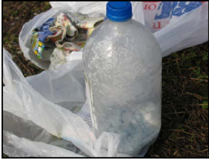
Plastic drink bottles