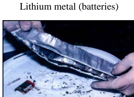
Lithium metal (batteries)