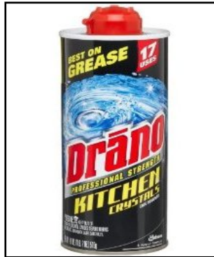
Sodium hydroxide (drain cleaner)