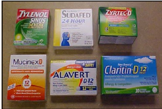
Pseudoephedrine or ephedrine based products and packaging