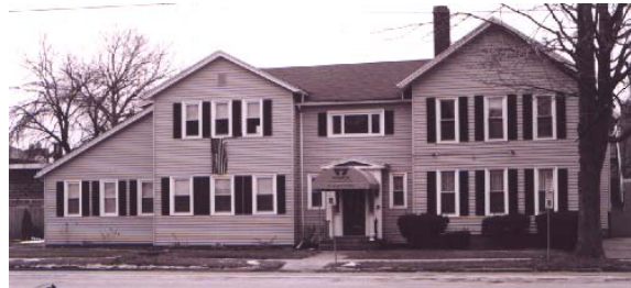
The YWCA of the Tonawandas

Domestic violence is one of the most under reported crimes; therefore, these statistics do not accurately represent the true scope of the problem and the immense cost to society.